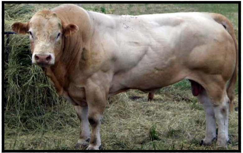
Arsha Lava 103L; sire & grandsire of many lots selling today

Another Lava daughter, and this time combined with Roseneath Jupiter and the dam of Lancaster. 410X is deep bodied and thick. She is also double polled.